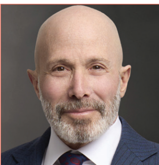
EVAN G. GREENBERG

Don't miss the highly interactive conference finale on Wednesday, 3:00 pm–4:00 pm. Featuring The Second City Works, a world-renown improv and sketch comedy theater, this might be the most fun you've ever had at a conference. Their alumni include legends like Tina Fey, Amy Poehler, and Bill Murray. ■