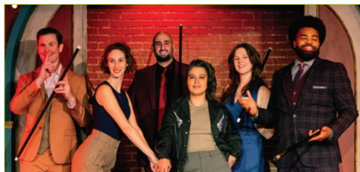
THE SECOND CITY WORKS